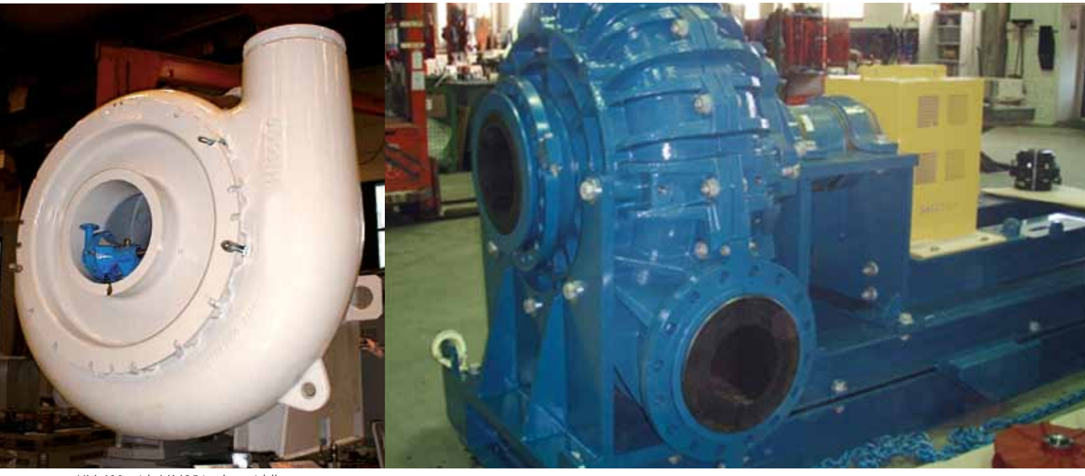
XM 600 with MM25 in the middle